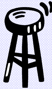
Think: Three Legged Stool